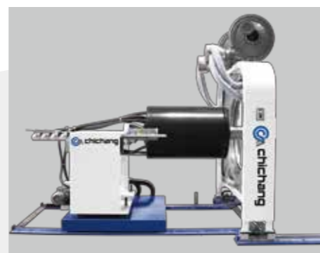
Air Cooling Ring & Forming Mandrel