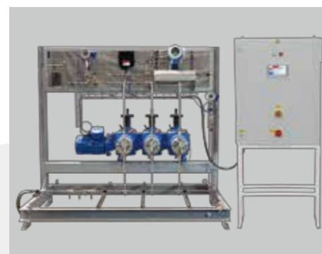
Lewa Butane Pump