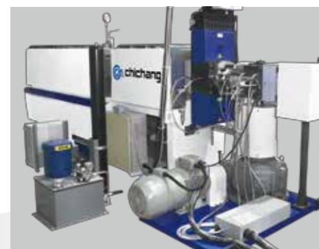
Gear Pump & Non-Stop Screen Changer