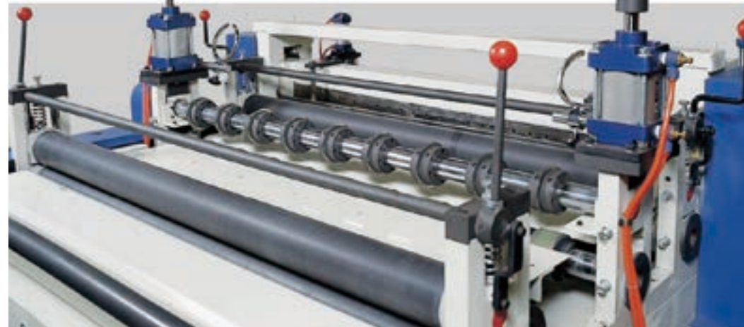
Edge Trimming & Slitting Unit