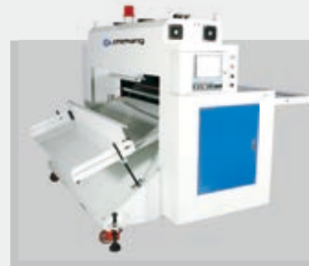
Cutting Unit Computerised