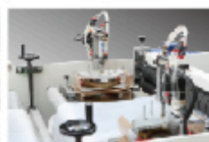
K型封设备 K type sealing device