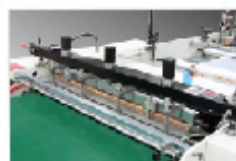
双面底封刀 Double face of bottom sealing knife